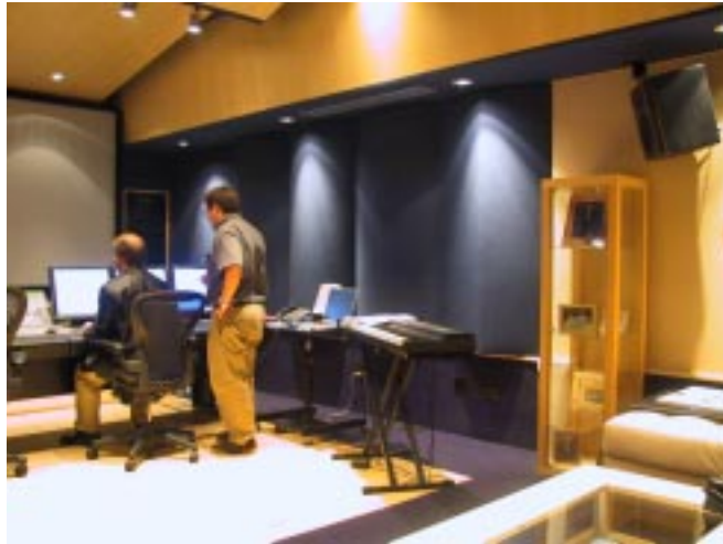
LSR28P situated in the rear surround position.

The LSR monitors are performing well for Danetracks. “We’re happy with the LSR28Ps,” explained Hackner. “We wanted something that was small, but gave us a full bandwidth surround speaker. We design sound effects for the surrounds in that we actually send car bys, explosions, and very big sounds into our surround speakers. For us, surround information is no different from LCR information. We’re really pressing the limits of those speakers.”